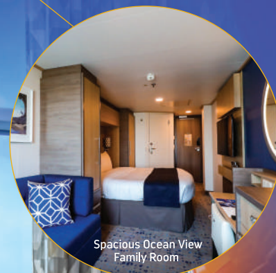
Spacious Ocean View Family Room