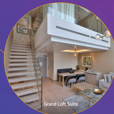
Grand Loft Suite