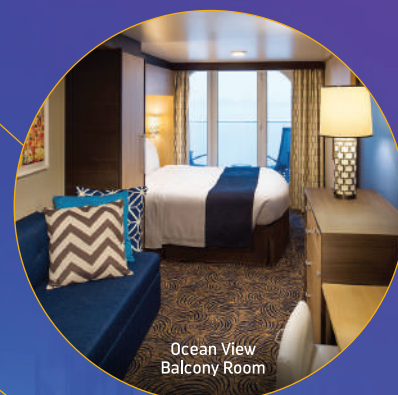
Ocean View Balcony Room