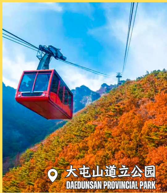
大屯山道立公园 DAEDUNSAN PROVINCIAL PARK