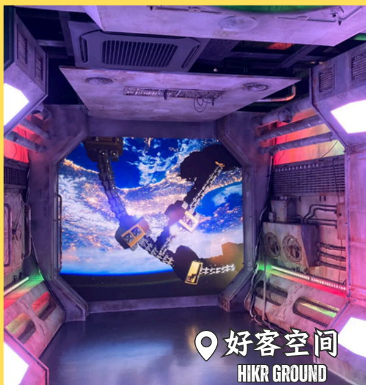
好客空间 HIKR GROUND