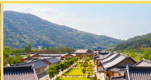
📍 韩屋酒店 ROYAL ROOM OF KING