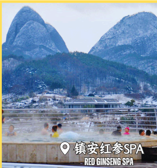
镇安红参SPA RED GINSENG SPA