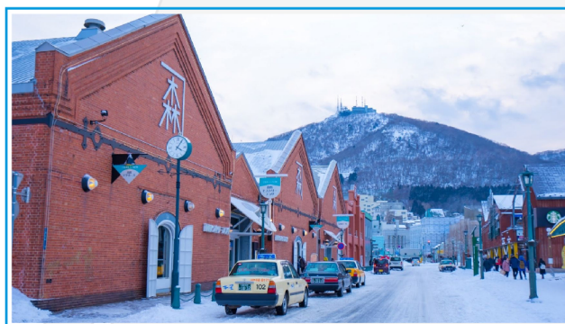
• Hakodate Redbrick Warehouse 金森红砖仓库

Transfer to Narita Airport for flight departure.