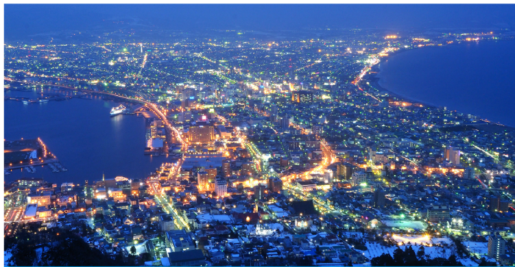
Enjoy viewing Mount Hakodate (rated three stars in Michelin Green Guide Japan) 欣赏被米其林评为三颗星景观-函馆山