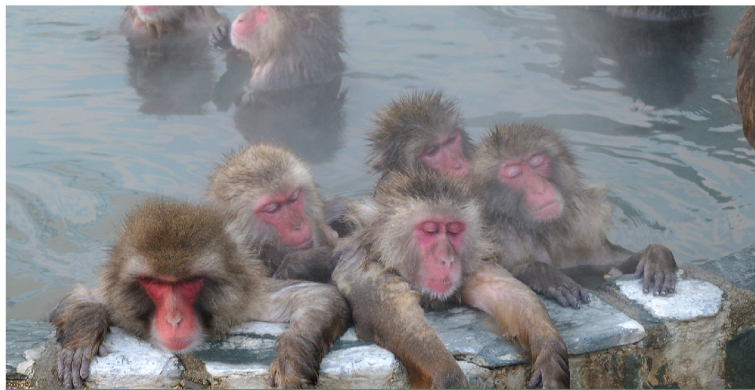
Hakodate Tropical Botanical Garden (Hot Tubbing Monkeys) 函馆植物园观看猴子泡温泉