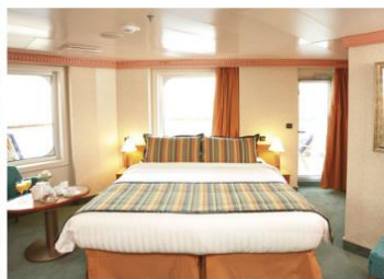
MINI SUITE 迷你套房