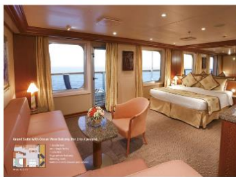
GRAND SUITE 高级豪华套房