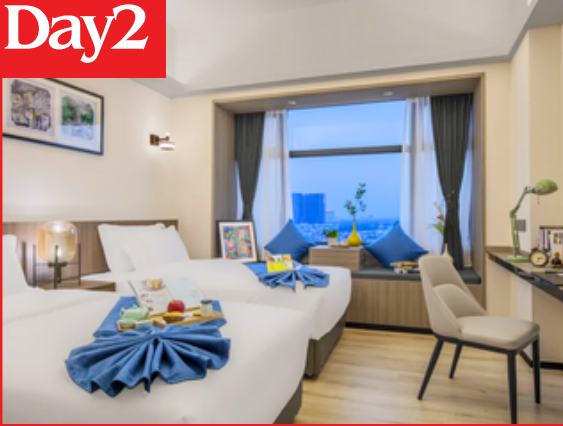
保利假日酒店 Holiday Inn