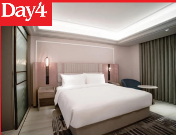
广州北京路美居酒店 Mercure Guangzhou Beijing Road Pedestrian Street Hotel