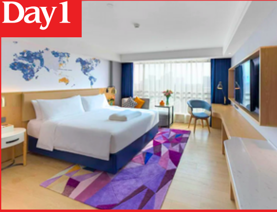
清远宫禾元酒店 Gongheyuan Hotel