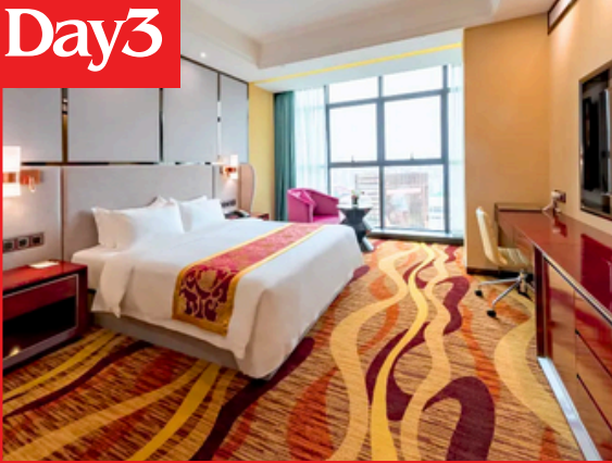
来魅力酒店 Zhuhai Charming Holiday Hotel