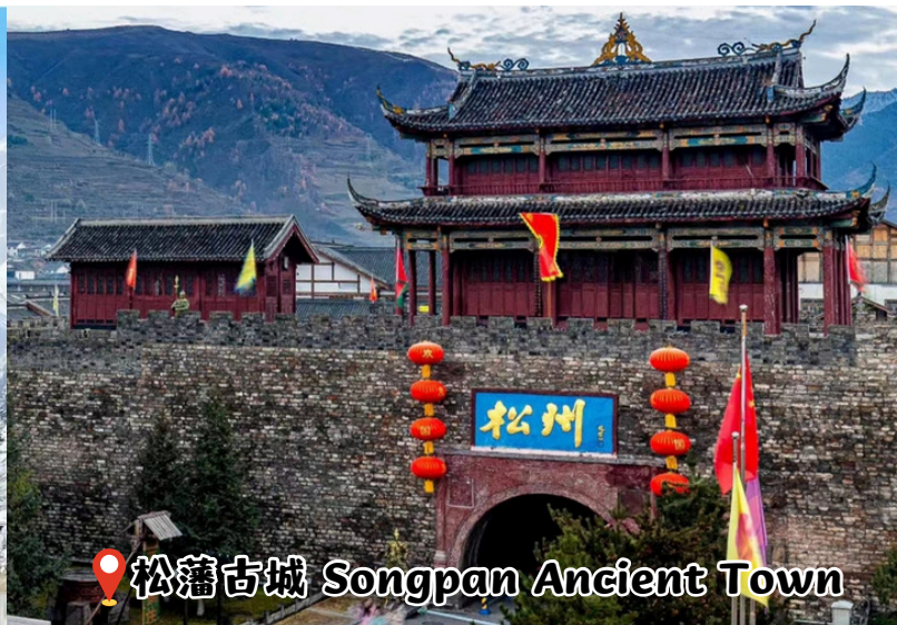
松藩古城 Songpan Ancient Town