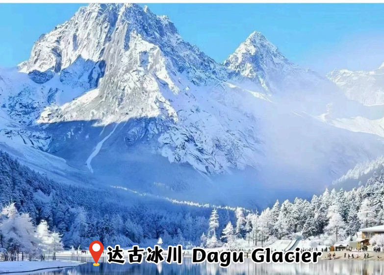
达古冰川 Dagu Glacier