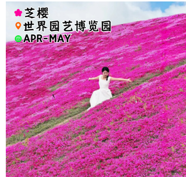
◆ 芝樱 ◆ 世界园艺博览园 ◆ APR-MAY