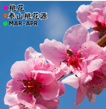
◆ 桃花 ◆ 泰山桃花源 ◆ MAR-APR

※按每年气候不同会有所改变，以上花期不能完全保证准确 ※The floral growing season is subject to weather conditions