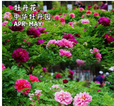
◆ 牡丹花 ◆ 中华牡丹园 ◆ APR-MAY