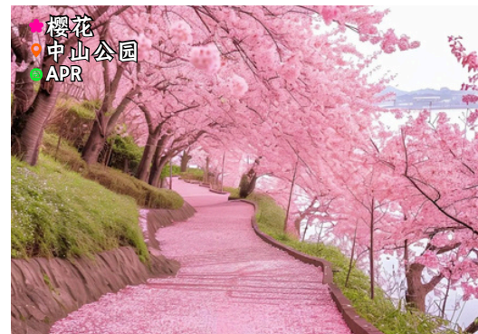
◆ 樱花 ◆ 中山公园 ◆ APR