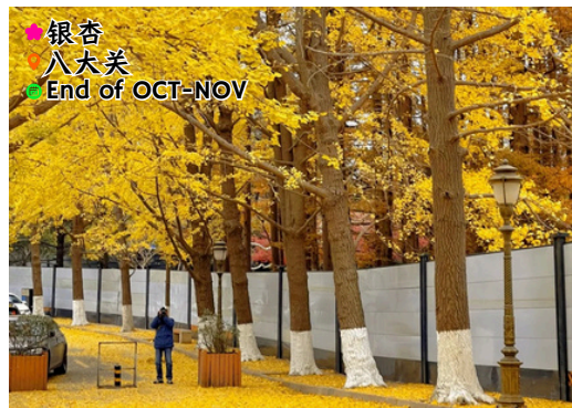
◆ 银杏 ◆ 八大关 ◆ End of OCT-NOV