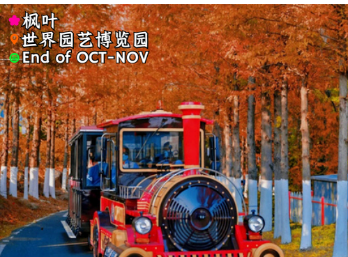
◆ 枫叶 ◆ 世界园艺博览园 ◆ End of OCT-NOV